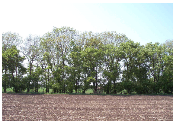
3: Windbreak in Micmanice, 4 th May 2006