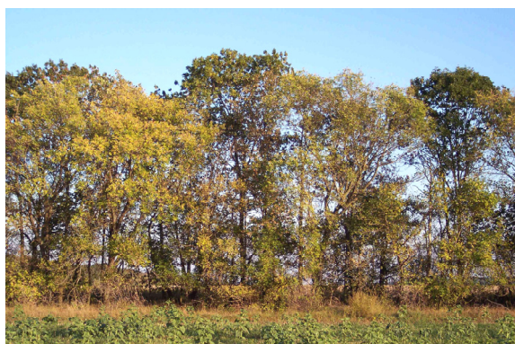
4: Windbreak in Micmanice, 12 th October 2006