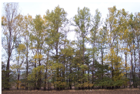
2: Windbreak in Suchá Loz, 20 th October 2007

Part of wood species forming the windbreak in Micmanice was not foliated yet, but with regard to species diversity and width of windbreak it happens to reduction of average wind speed on leeward side about 64% and windbreak influence was perceptible in maximum distance of 200 m (Tab. III).