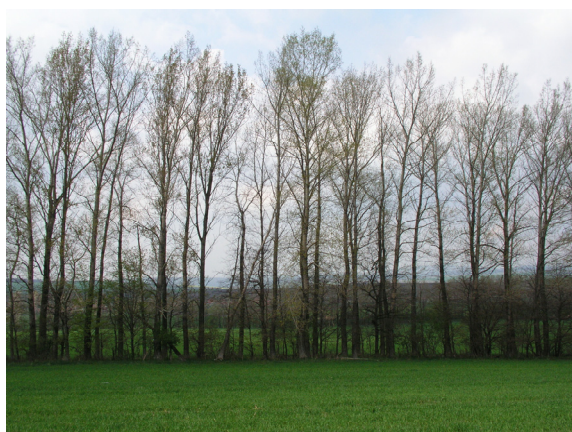
1: Windbreak in Suchá Loz, 18 th April 2007

The windbreak in cadastral territory Suchá Loz was partially, sporadically foliated in term of measurement. Results of horizontal wind profile measurement are in Tab. II. Analysis of results of horizontal measurement demonstrated wind speed reduction in 50–100 m behind windbreak (34 and 37% in evaluation of average speed) with rapid increase in longer distances.